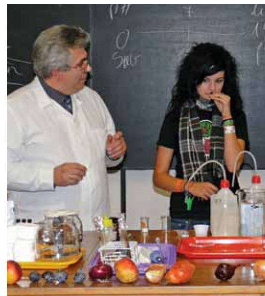
ON THE "REASERCHERS' NIGHT"

The legal predecessor of the FACULTY OF AGRICULTURAL AND FOOD SCIENCES was one of the first agricultural higher educational institutions in the world. Its professors were the ones to create Hungary's national professional research network. The ex-