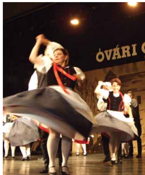
THE FOLK-DANCE GROUP ÓVÁRI GAZDÁSZ WAS FOUNDED IN 1957

To form community spirit and cultivate friendship, special evenings and days are held during the whole academic year.