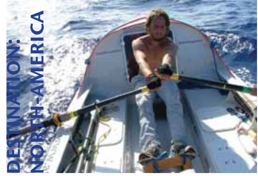
'FIREANT' HAS CROSSED THE ATLANTIC

Besides high quality sports education, the university is also proud of its competitive sports. The SOPRON SPORTS ASSOCIATION OF THE UNIVERSITY OF WESTERN HUNGARY, SMAFC – made legendary by its basketball players - was founded in 1860 and has continuously operated as one of Europe's oldest sports associations ever since. Today excellent results are being achieved in many of the association's sections e.g. in karate (European