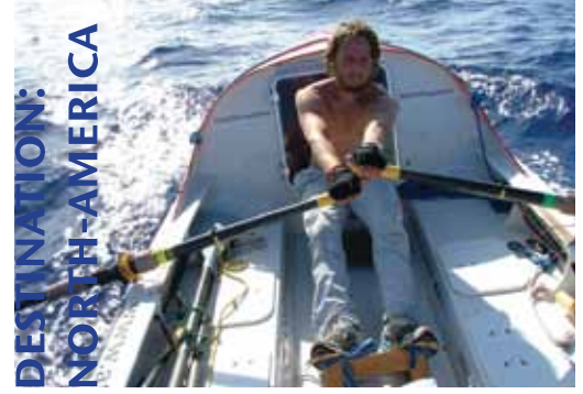
'FIREANT' HAS CROSSED THE ATLANTIC

Besides high quality sports education, the university is also proud of its competitive sports. The SOPRON SPORTS ASSOCIATION OF THE UNIVERSITY OF WESTERN HUNGARY, SMAFC – made legendary by its basketball players - was founded in 1860 and has continuously operated as one of Europe's oldest sports associations ever since. Today excellent results are being achieved in many of the association's sections e.g. in karate (European