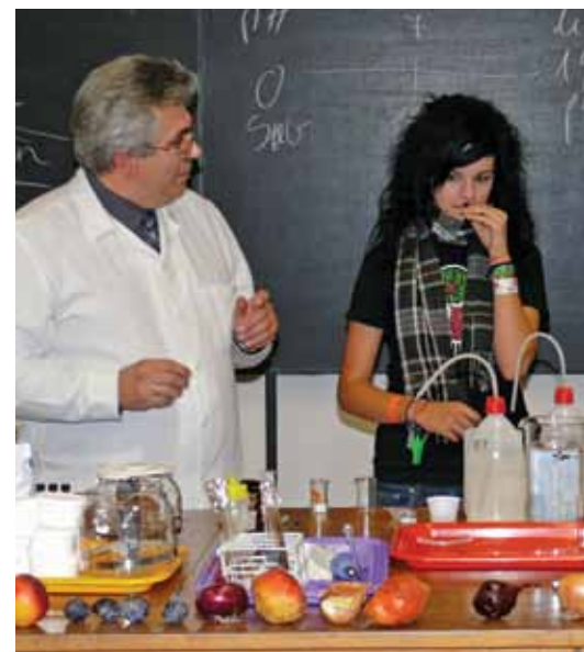
ON THE "REASERCHERS' NIGHT"

The legal predecessor of the FACULTY OF AGRICULTURAL AND FOOD SCIENCES was one of the first agricultural higher educational institutions in the world. Its professors were the ones to create Hungary's national professional research network. The ex-