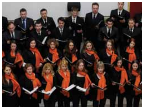
BERZSENYI DÁNIEL MIXED CHOIR - THEIR REPERTORY IS EXTREMELY RICH, RANGING FROM A CAPPELLA CHORUS WORKS TO ORATORY PIECES.