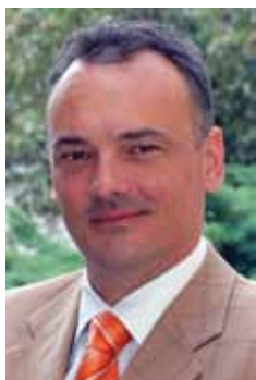
ZSOLT BORKAI, CURRENT MAYOR OF GYŐR AND OLYMPIC CHAMPION IN MEN'S POMMEL HORSE IN 1988, SEOUL, ALSO STUDIED IN SZOMBATHELY

The FACULTY OF NATURAL SCIENCES in Szombathely (Savaria University Centre) established a high-tech observatory to promote education and research. The Kövesligethy Radó Educational Observatory is involved in a joint research programme in the field of solar physics with the Slovenian Central Observatory (SUH).